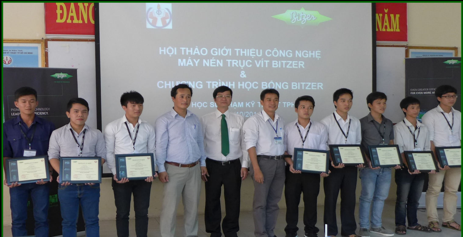
BITZER Scholarship Ceremony 2014 Ho Chi Minh City University of Technology and Education

BITZER Refrigeration Asia Limited (Vietnam Representative Office) Level 4, Centec Tower, 72-74 Nguyen Thi Minh Khai St. District 3, Ho Chi Minh City, Vietnam Tel +84 (8) 3822 7024 / 3822 7025 Fax: +84 (8) 3822 7026